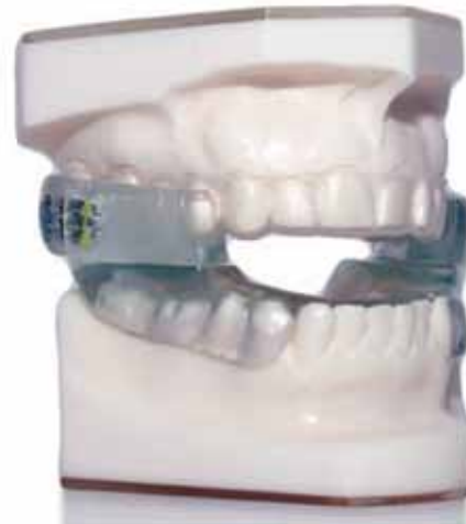
Fig. 1. The Moses™, an open anterior, adjustable, FDA cleared oral airway dilator.

A previous study by Moses 18 demonstrated visually the effect of an oral appliance (Figure 1) to actually achieve airway dilation. Placing that oral device in the mouth gives the appearance of airway dilation similar to the splinting effect of CPAP (Figure 2). The dilation from the appliance however, occurred downstream from the actual site of the appliance in the mouth. Note in Figure 2 (right) the enlargement of the airway in the area of the pharyngeal constrictors. The pharyngeal constrictors are not attached to either the tongue or the mandible. The effect of the oral appliance sitting in the mouth is not as simple as tongue and/or mandibular advancement. It has a more complex effect on the entire airway, more closely resembling inflation of a balloon.