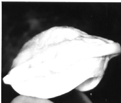
Fig. 2 Farrar type appliance

The conventional appliance treatment of acute closed lock (Fig.2) causes dysphagia as measured by computerized mandibular scanning. 2 The introduction of deleterious neuromuscular forces, in my opinion, contraindicates this appliance if a better alternative is available.