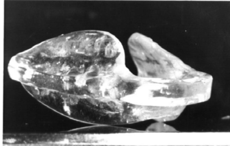
Fig. 1 Passivator

The criteria held for any appliance prescribed for intraoral use, besides being clinically effective, are that it be comfortable, neither decrease volume of space for the tongue nor adversely affect breathing and swallowing, and that it do no damage to the teeth, muscles and periodontia.