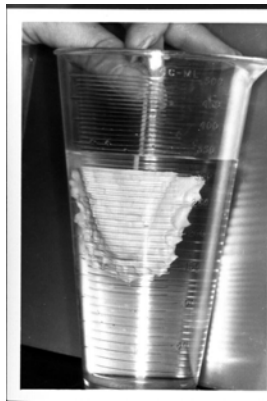
Fig. 4 Measurement of tongue space by volumetric displacement.

between the models. When the alginate set, the models were separated and the passivator plus the attached alginate was measured volumetrically in the graduated beaker. The appliance was then separated and the volume of the appliance measured separately. Because the appliance occupies space in the oral cavity which the tongue cannot occupy at the same time, the volume of the Passivator was subtracted from the total and the remaining volume defined as "tongue space available with Passivator."